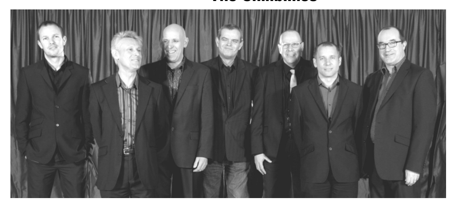
PRESENT The Chillbillies

The Chillbillies, are seven piece outfit including three-piece Horn 'The Raging Horns'. The band originally formed in 1990.